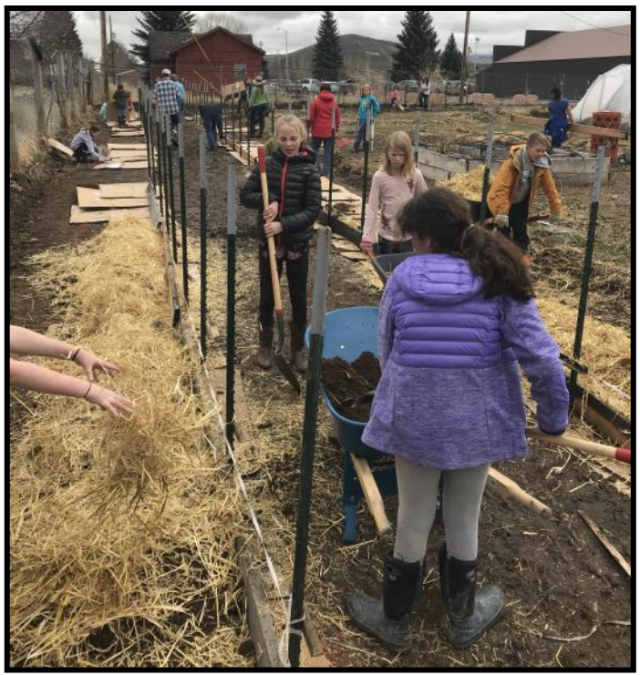
Pioneer Elementary fifth graders work together to begin constructing new "lasagna beds" for the Pumpkin Patch.

In May, the fifth graders visited the Salmon School Garden to start their pumpkin plants, including a variety of carving, pie, mini and decorative pumpkins, and will be planting their seedlings the last week of school. Look for dates for the Pumpkin Patch Sale coming in late October!