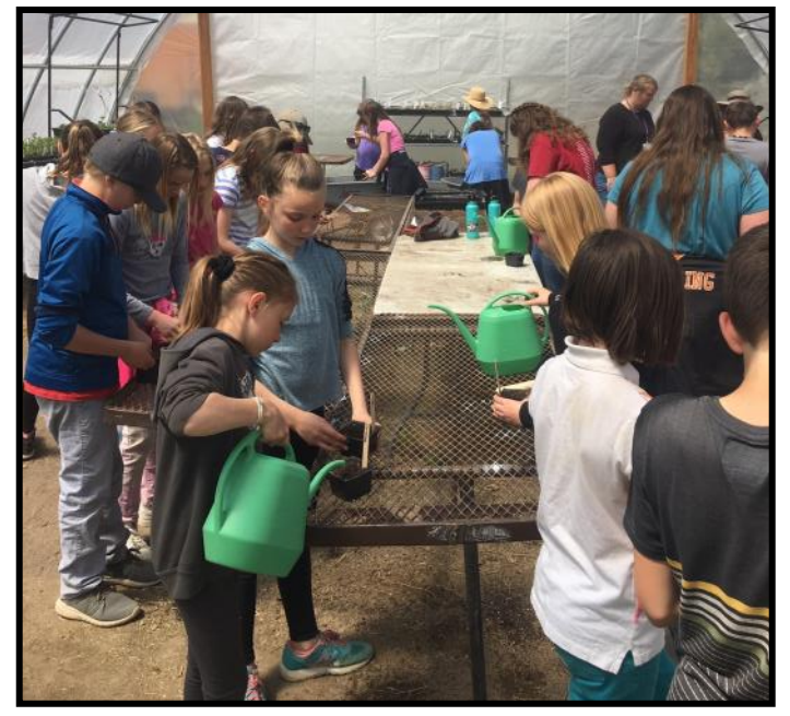
Pioneer Elementary fifth graders planting a variety of pumpkin seeds to transplant later in May.