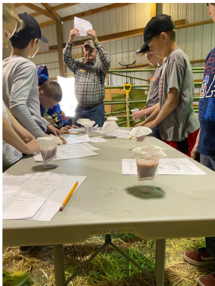
Fifth grade students wait for their DNA extraction experiment to filter while learning about DNA in the beef industry.