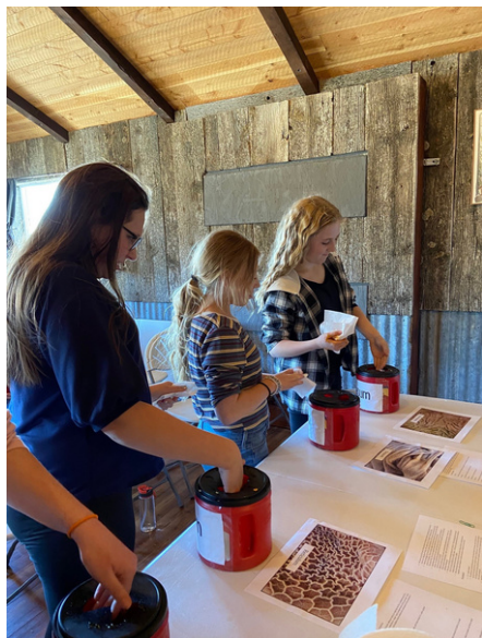
Sixth grade students stick their hands in containers simulating the feel of each of the four compartments of the ruminant digestive system.

News from Lemhi Regional Land Trust & the Salmon School Garden