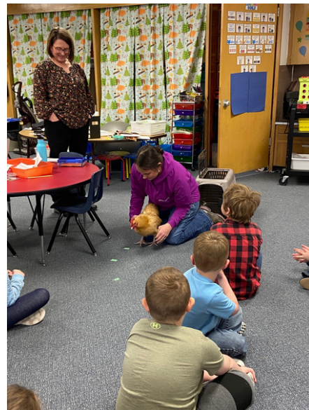
Kindergartners get acquainted with "Golden Girl" the chicken after learning about the parts of a chicken.