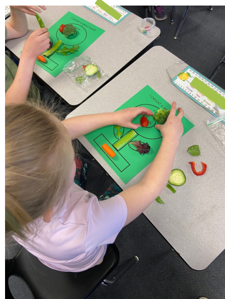
First graders work to construct a plant out of vegetables and determine if they really can eat all the parts of a plant.

Fifth grade was able to resume their traditional field trip to the University of Idaho's Nancy M. Cummings Research, Extension and Education Center, which included learning about DNA in the beef industry and each student getting a chance to extract DNA from strawberries. New this year for LRLT was joining in on the sixth grade field trip to Mountain Valley Farmstead, a milking sheep dairy in Carmen. There students took part in a "feel lab", where they were able to stick their hands in the four different containers that simulated the compartments of the ruminant digestive system.