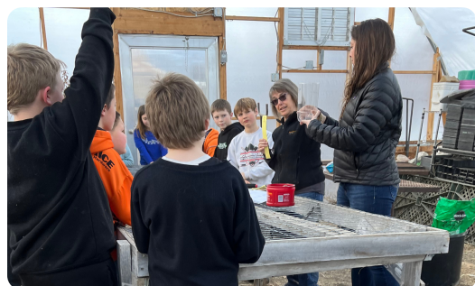
Kids deciding what depth to plant their potato.